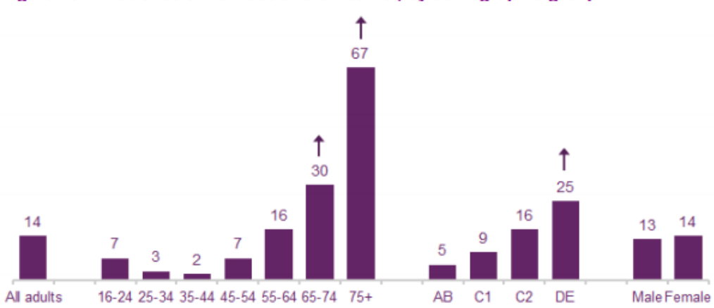
Figure 186: Incidence of non-use of the internet, by demographic group

Ofcom's latest Adult Media Use and Attitudes Report<sup>2</sup>, 14% of UK adults remain not online (for any reason) and are more likely to be aged over 65, and in DE households. Two in three people aged 75+ are non-users of the internet. The figure below illustrates this further and shows that while 14% of adults in the UK are non-users of the internet, this this is more likely for those aged 65-74 (30%) and 75+ (67%) as well as among DEs (25%). While not shown in the chart there has been no significant change in this incidence of non-users among all adults since 2013 (17% in 2013 vs. 14% in 2014).